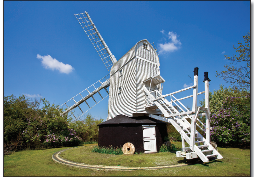
Holton Windmill sits on an elevated location overlooking the village of Holton.