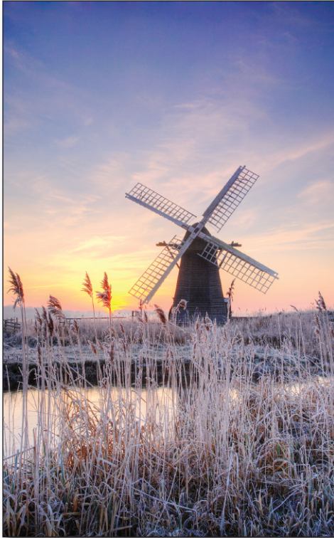
Here the mill at Herringfleet can be seen at dawn following a winter hoarfrost.