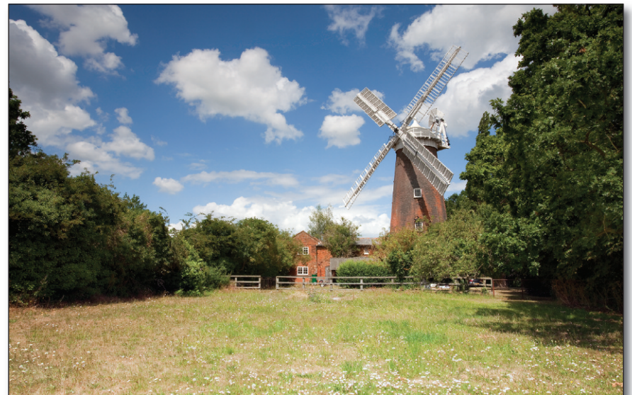
Built in 1836 Buttram's Mill is one of England's finest tower windmills. The mill, located in Woodbridge, was built by the famous Suffolk millwright John Whitmore.