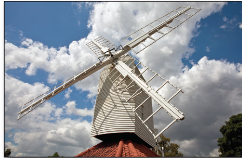
The sails of Thorpness Mill seen against a cloudy summer sky.