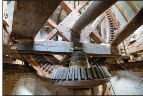
The brake wheel and windshaft of Pakenham Windmill.